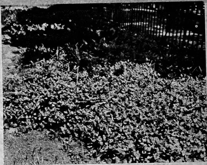
Euonymus Fortunei Coloratus—Purpleleaf Winter Creeper